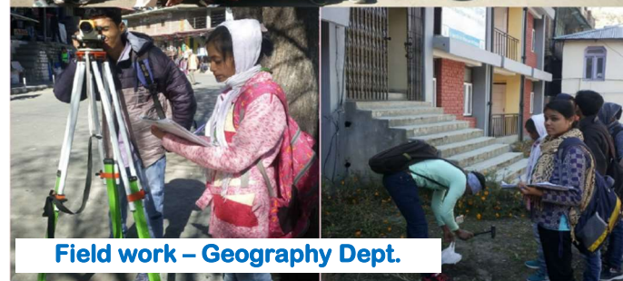
Field work – Geography Dept.

more interesting. This brings the students to come in contact with the common people of all sorts. Students will not be allowed to appear for the practical examination without field work and field note book. Excursions / field work will be conducted in different subjects as per the requirements of the curriculum.