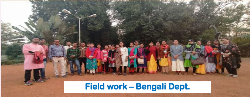
Field work – Bengali Dept.